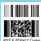
RSS & PDF417 Codes